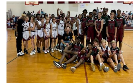
Boys vs. Girls basketball game

year, through hat days, classroom competitions, “Dime Wars” and the Boys vs. Girls basketball game, we raised a grand total of $8,159.85. for Relay for Life! Each year, our Mustang family continues to work hard to make sure no one goes through the battle with cancer alone.