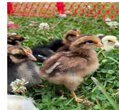
The chicks explore their new home