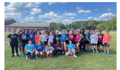
2022 Track & Field Team