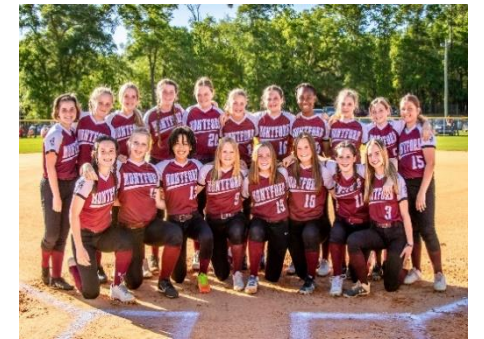
2022 Lady Mustang Softball Team

what it takes to continue their success all the way to the championship!