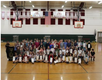
2022 Beta Inductees