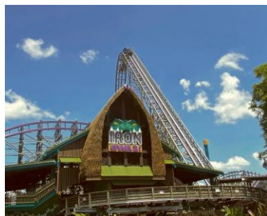
The Iron Gwazi, a popular Busch Gardens coaster